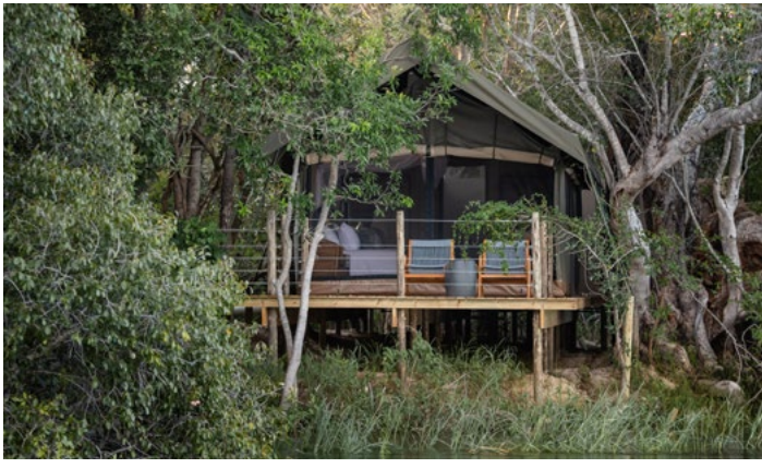
Eight tented suites secluded in ancient forests overlooking the Zambezi River. Luxury and wild romance as you share life-changing experiences on this once in a lifetime holiday. Cherish your private moments, enjoy our raw and refined luxury. Feel fully alive.